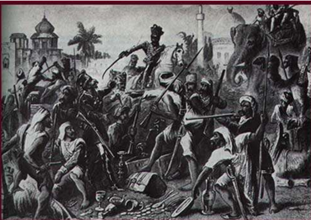
Tabloid Journalism, 1857. Mutinous Indian troops dividing the spoils, as envisaged by the Victorian twittering classes.