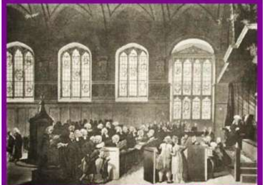
Images of Kings Bench, 1770s