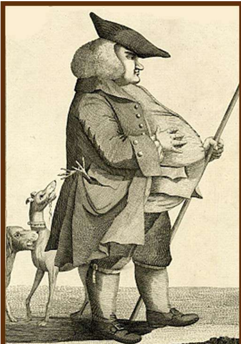
Mid C18th caricature of an over-fed Parish Constable